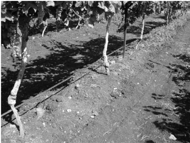
Fig. 2. Empty plastic water bottles used for applying the water in the root zone of the vines. The incidence of the weeds was also reduced as result of application of irrigation water below surface.

as fertigation. A maximum of 60 bunches per vine were retained after the fruit pruning.