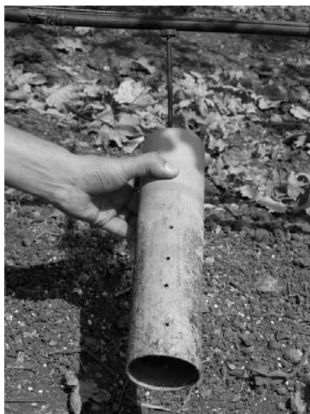
Fig. 3. Holes were made in the lower portion of the hollow pipe to facilitate the lateral movement of the irrigation water.