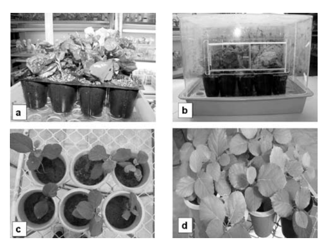
Fig. 2. Hardening of micropropagated lasora plants.(a) transfer to ex vitro conditions; (b) acclimation under hardening chamber; (c) transfer to polyhouse for bio-hardening; and (d) Successful weaning after one-month).

who reported better root formation with addition of activated charcoal.