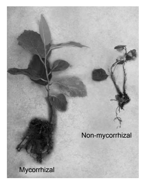
Fig. 4. Growth response of mycorrhizal and non-mycorrhizal lasora plantlets.

Fig. 3. Plant survival (%) in lasora as affected by mycorrhizal inoculation during bio-hardening.